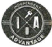
Independent Advantage Business Coverage